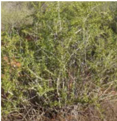
Control Currant bush