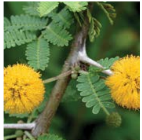
Control Mimosa bush (Permit 13891)