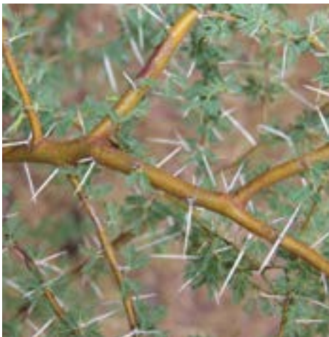
Control Prickly acacia